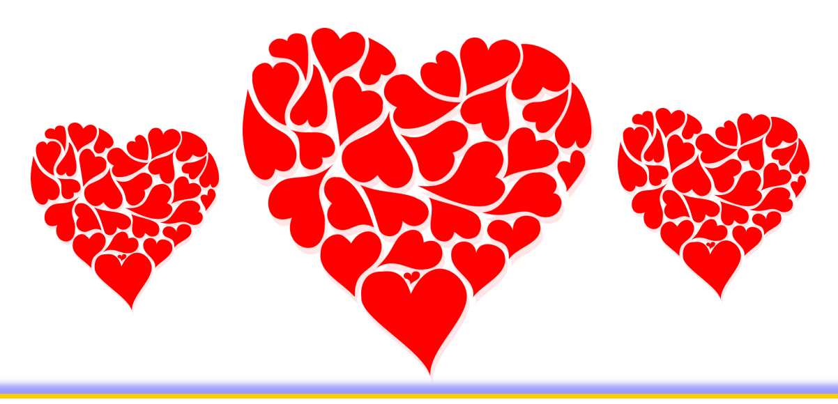
Feb 2 Ord Chamber/Valley County Economic Development Annual Celebration-Trotter's-728-7875 for info